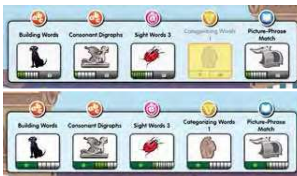
Level 6 Activity Selection Screens, First Half and Second Half

To pace students through a level, the first half of all activities must be completed before the second half is “unlocked.” The unit boxes fill with green as the student completes units. Activities cannot be selected after all units are complete.